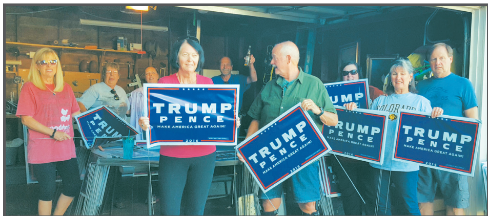
Pueblo Trump organizers distributed 5,000 yards signs to Pueblo and neighboring counties.